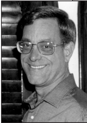
Robert “Bob” Gale Class of 1969